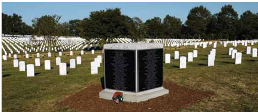
Fig. 7 (below). The 9/11 memorial at Arlington National Cemetery, Virginia, just outside Washington DC. Fig. 8 (bottom). Architect's impression of the Memorial Plaza at the Flight 93 National Memorial near Shanksville, Pennsylvania.

The current plan is for each of the two million predicted annual visitors to pass a concrete wall carrying a quotation from Virgil: 'No day shall erase you from the memory of