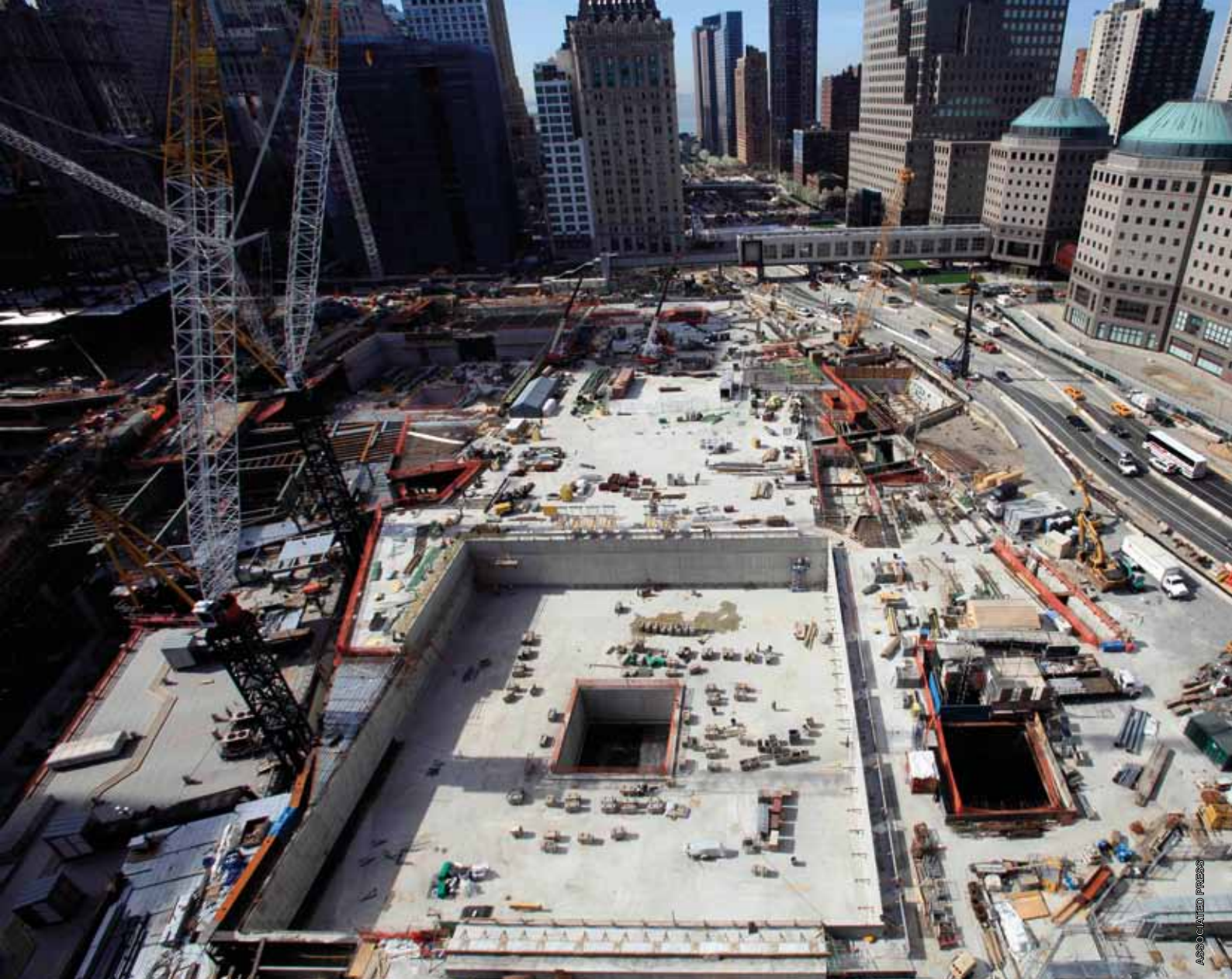
Fig. 5 (above). Construction of the National September 11 Memorial and Museum at the World Trade Center site in New York City. April 2010.