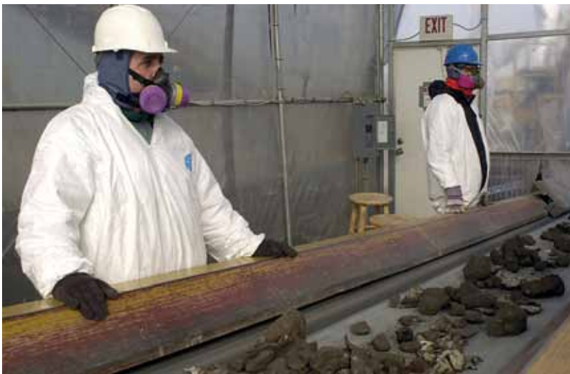
Fig. 3 (top). Front end loader at Fresh Kills Landfill handling material from Ground Zero in the search for remains.